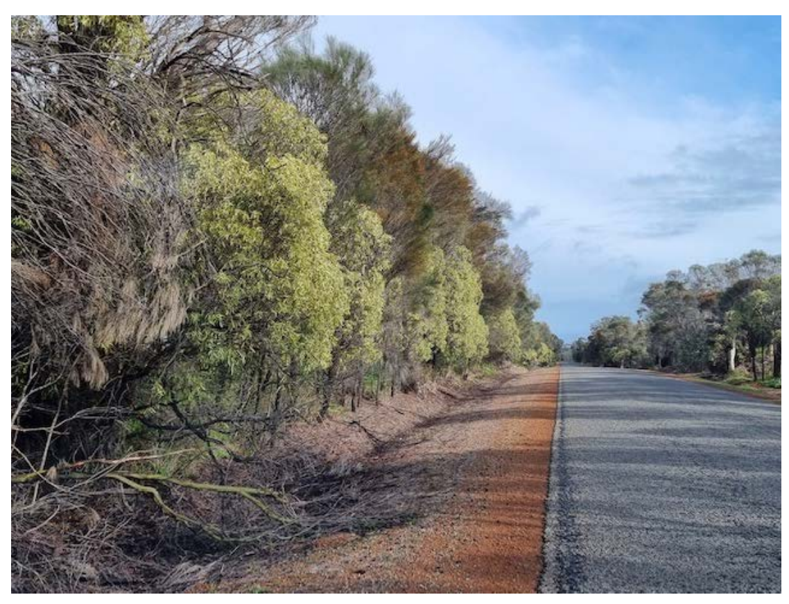
Figure Three – Facing North on Shenton Road