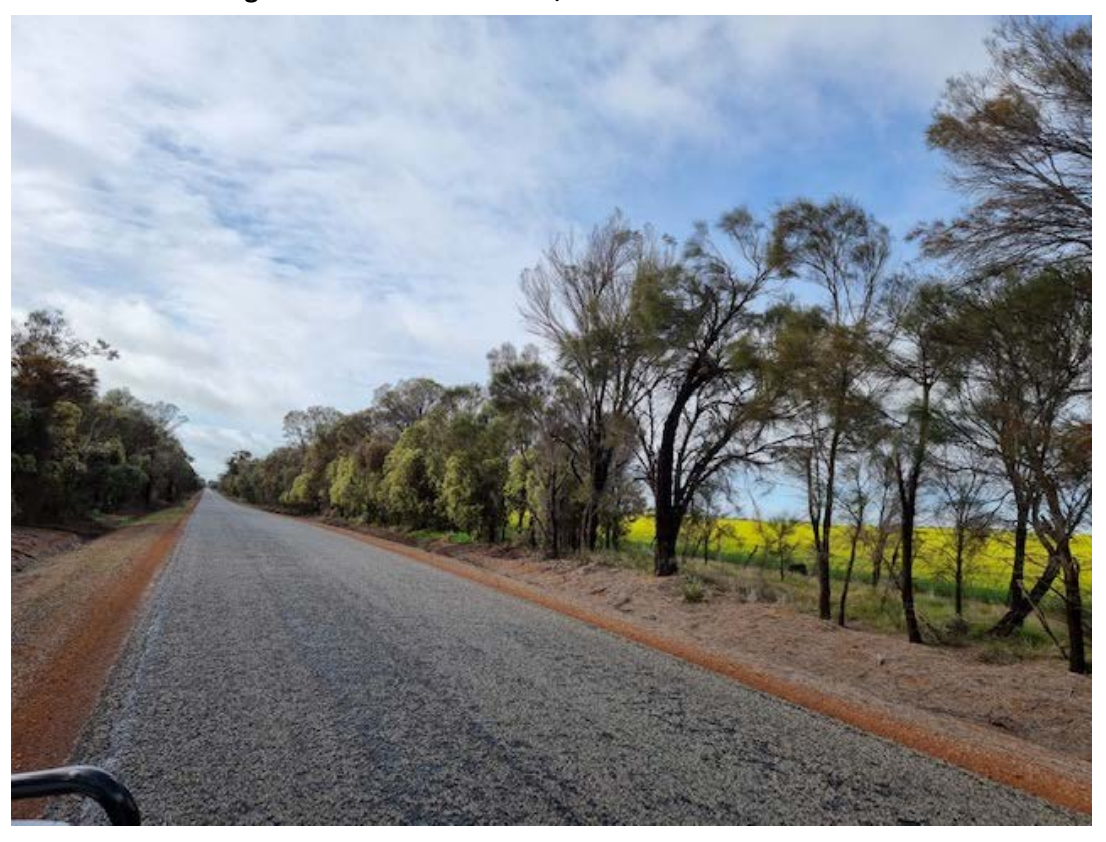
Figure Two – Facing South on Shenton Road